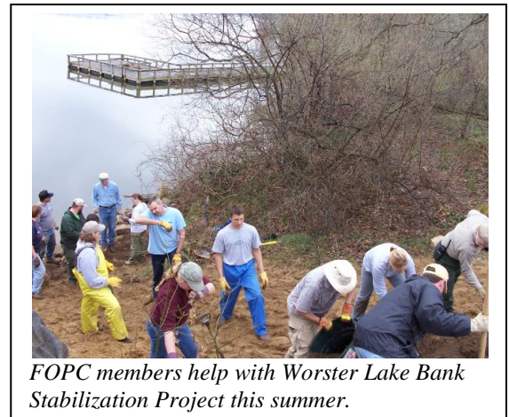
FOPC members help with Worster Lake Bank Stabilization Project this summer.