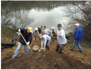
Volunteers and FOPC members help with Friends lake bank stabilization project

eventually the campground, won't that be nice and smooth?