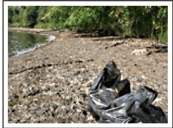
100 trash bags filled during Worster Lake Clean Up

collected by the group on September 16th, while the water levels were low during the Gizzard Shad treatment.